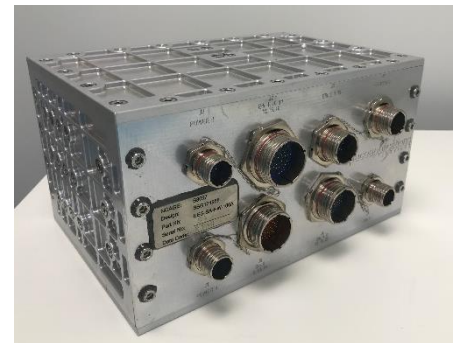
REG-20-RT-R (dual lane) Flight Model