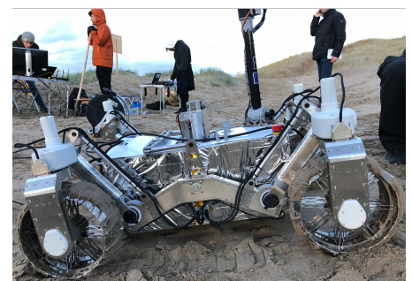
Surface proximity configuration