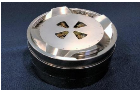
Two HOTDOCK interfaces before coupling

A product line of mating interfaces providing androgynous coupling to transfer mechanical loads, electrical power, data and (optionally) thermal loads through a single interface. It allows assembly and reconfiguration of spacecraft and payloads on-orbit and on planetary surfaces. It supports launch loads and it makes it straightforward to replace failed modules, to swap payloads and provides chainable data interfaces for multiple module configurations. It is available in different dimensions and can be optimized for specific needs and budgets – including CubeSats to payloads of opportunity.