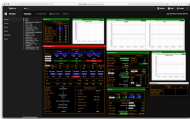
Example of Yamcs display

Yamcs is a cost-efficient suite of tools for spacecraft, payload and ground segment operations preparation, execution and spacecraft AIT. Yamcs has been used for ISS internal and external payloads and facilities as well as other customers/applications. Yamcs Suite include a display development tool and other advanced modules.