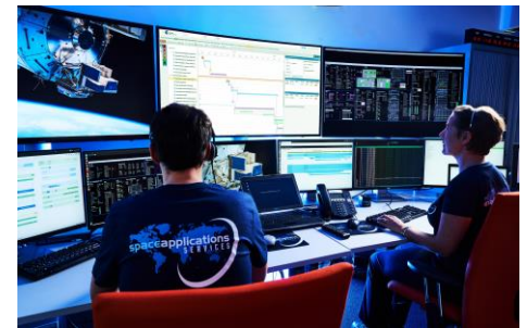
Planning Model Builder

The Exploded View provides the users with the possibility to visualise the Temporal Constraints links between the different elements of the Planning Models, as well as the internal Temporal Constraints.